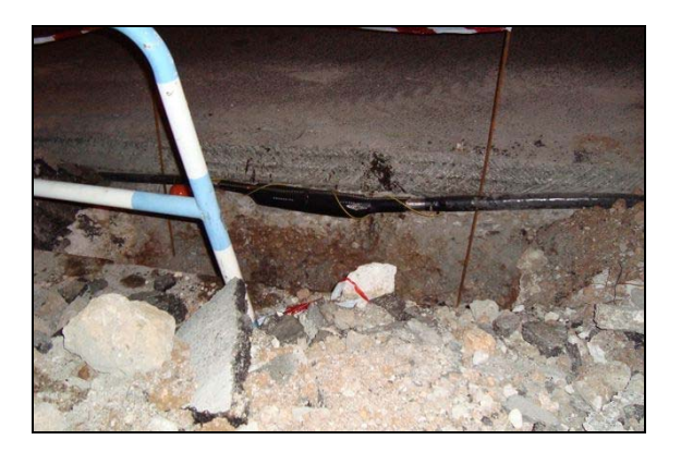
Figure 8 Underground telecommunication landlines were damaged and being repaired.