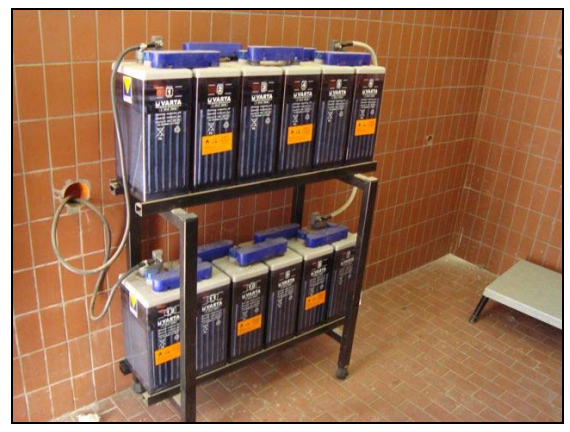
Figure 6 Unanchored battery racks and the batteries on the racks were not secured were common in substation control rooms.