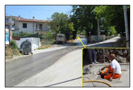
Figure 11 A water valve in a manhole was being repaired in Paganica.