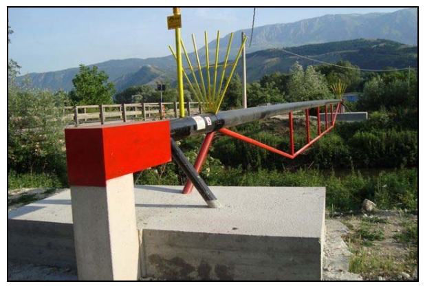
Figure 15 This new gas pipeline replaced the old damaged one in Onna. Note that the pipe is fixed on the concrete block.