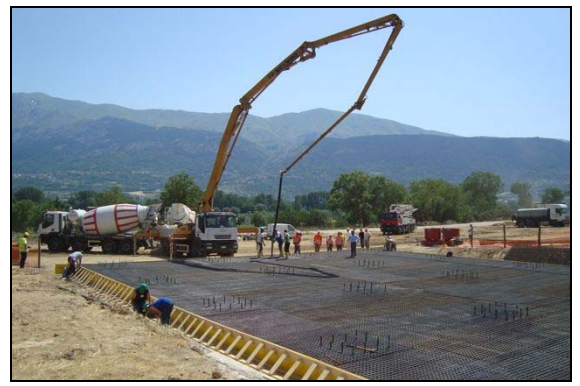
Figure 17 The base pad for the temporary housing units was being filled with concrete. There were three pads on this site.