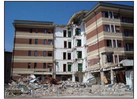
Figure 16 The student dormitory was severely damaged with one part collapsed.