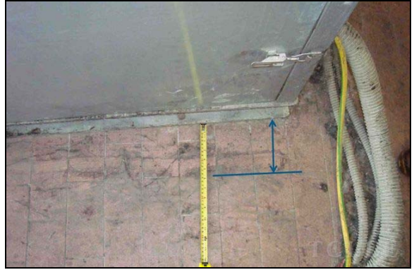
Figure 14 The pump in the control room of the new wastewater treatment plant was not anchored and shifted during the earthquake. It shifted about 15 cm.