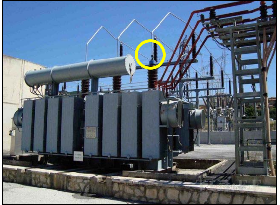
Figure 1. The rigid bus connection at the top of the transformer was damaged during the earthquake.