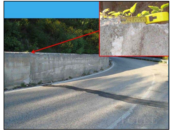
Figure 9 Some part of the State highway SS80 was damaged, this shows the displacement of the retaining wall and surface crack on the road surface. The offset was about 9 cm.