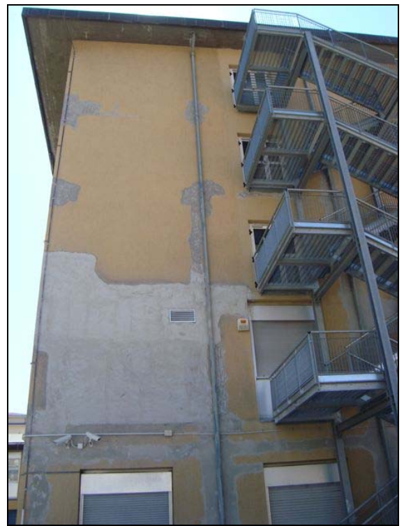
Figure 3 The electric power network control building was damaged and repaired.