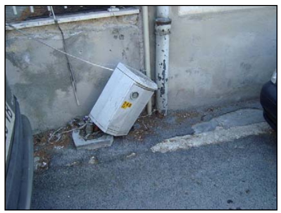
Figure 2 A lot of this type of low voltage distribution connection boxes was damaged resulting in power interruption.