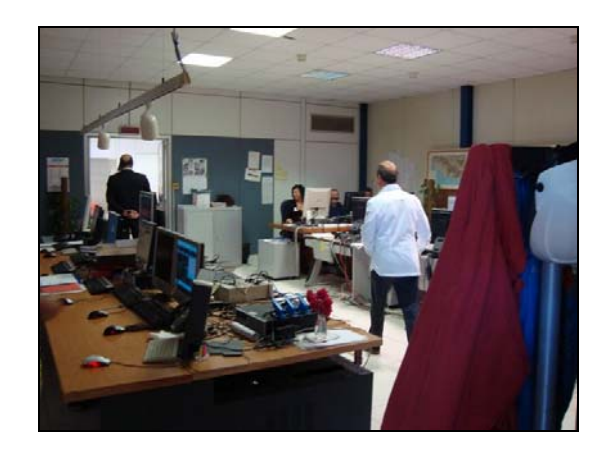
Figure 4 The temporary electric power network control room was set up and operational within 12 hours after the earthquake.