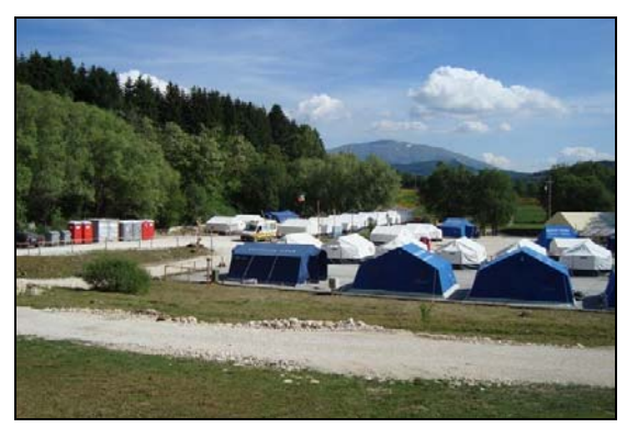
Figure 18 This is one of the many shelter areas organized by Civil Protection Agency, the Red Cross, the military and the fire brigade.