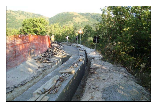
Figure 10 Road surface rupture repair was in progress.